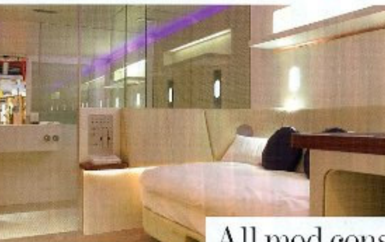
By 2006, the Yotel company plans to have a Yotel, above, at every major UK airport. Below, Murano Urban Resort, Paris