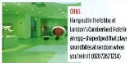
CHILL Hang out in the lobby at London's Cumberland Hotel in an egg-shaped pod that plays sound bites at random when you're in it (020 7262 1234)