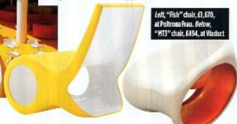
Left, "Fish" chair, £1,670, at Poltrona Frau. Below, "MT3" chair, £494, at Vitacut