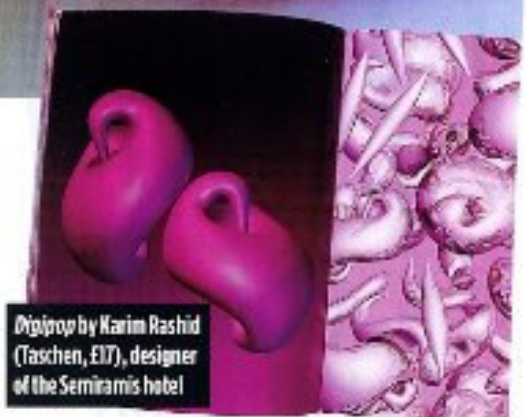
Odygprop by Karim Rashid (Taschen, £17), designer of the Semiramis hotel