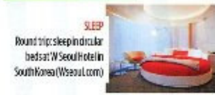
SLEEP Round trip: sleep in circular beds at W Seoul Hotel in South Korea (Wseoul.com)