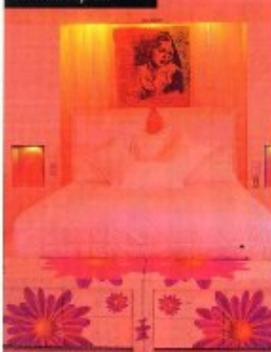
Below, the Semiramis hotel in Athens