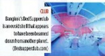
CLUB Bangkok's Bed Supperclub is an oval site that appears to have been beamed down from another planet.