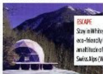
ESCAPE Stay in Whitepod's eco-friendly luxury pod at an altitude of 1,700m in the Swiss Alps